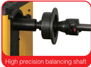
High precision balancing shaft