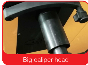
Big caliper head