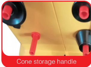
Cone storage handle